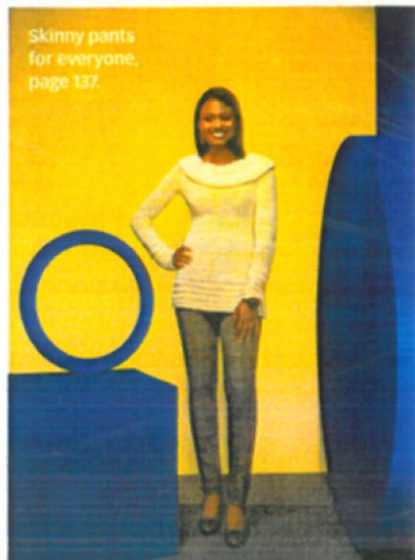
Skinny pants for everyone, page 137.