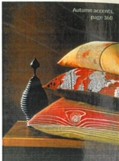
Autumn accents, page 360.

COVER/HERE WE GO P.59 Sweater, Naeem Khan, $1,100, Bergdorf Goodman, NYC; 212-753-7300. Earrings, Martin Katz; 866-956-7200.