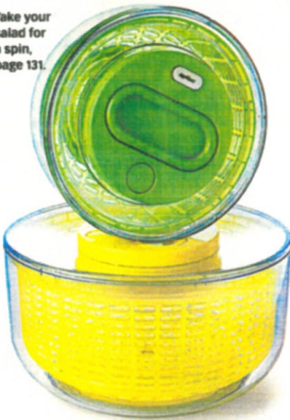
Take your salad for a spin, page 131.